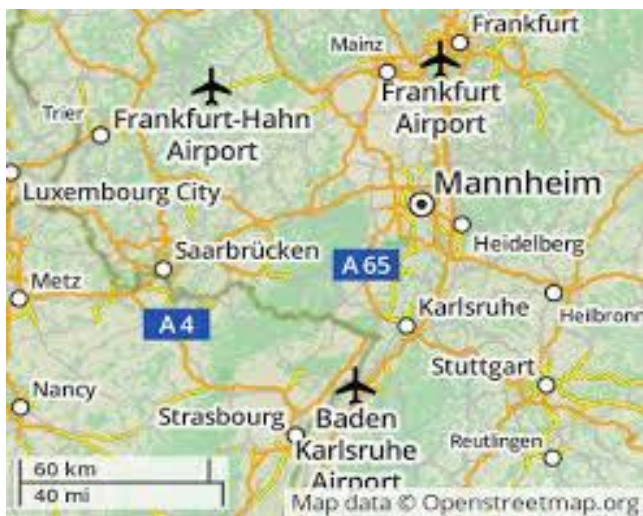
Mannheim Location – Close to Frankfurt Airport