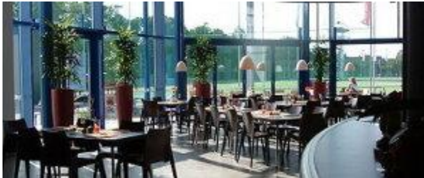
Mannheim Club Restaurant