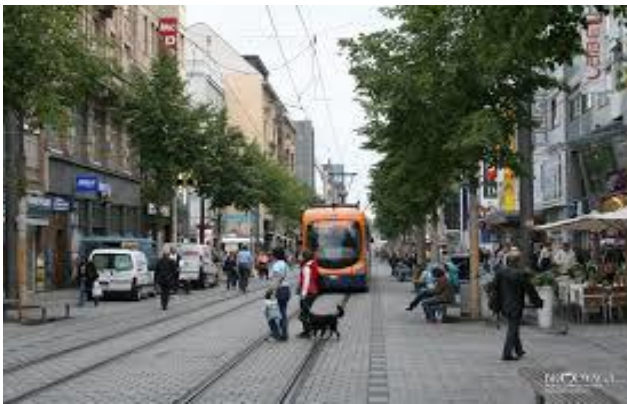
Mannheim Central Area – Public Transportation