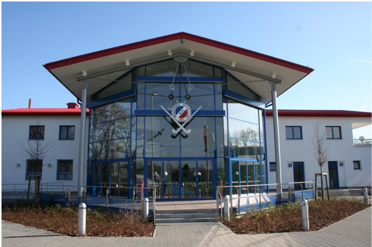
Mannheim Club Main Entrance