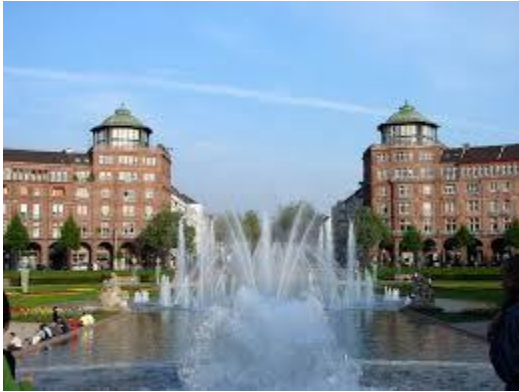
Mannheim Central Area