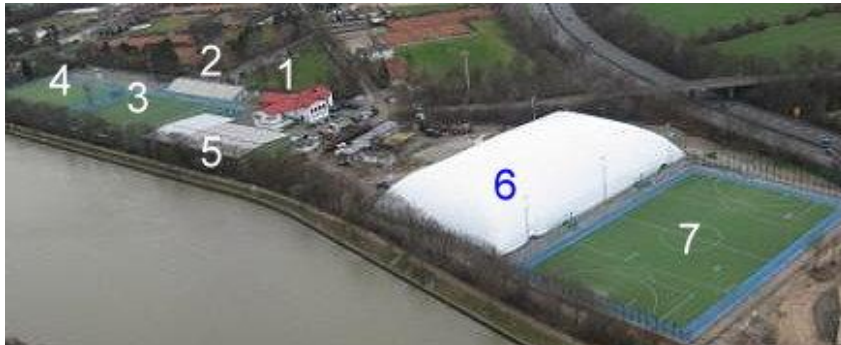
Mannheim Club Facilities – Several Fields