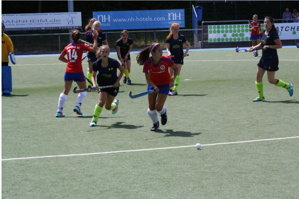
HTC player competing for Mannheim U16 A Club